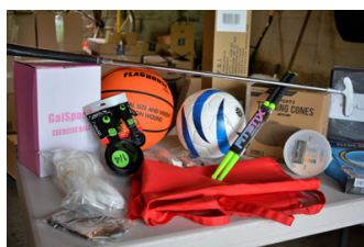
Equipment that was sent home for campers to use and keep.