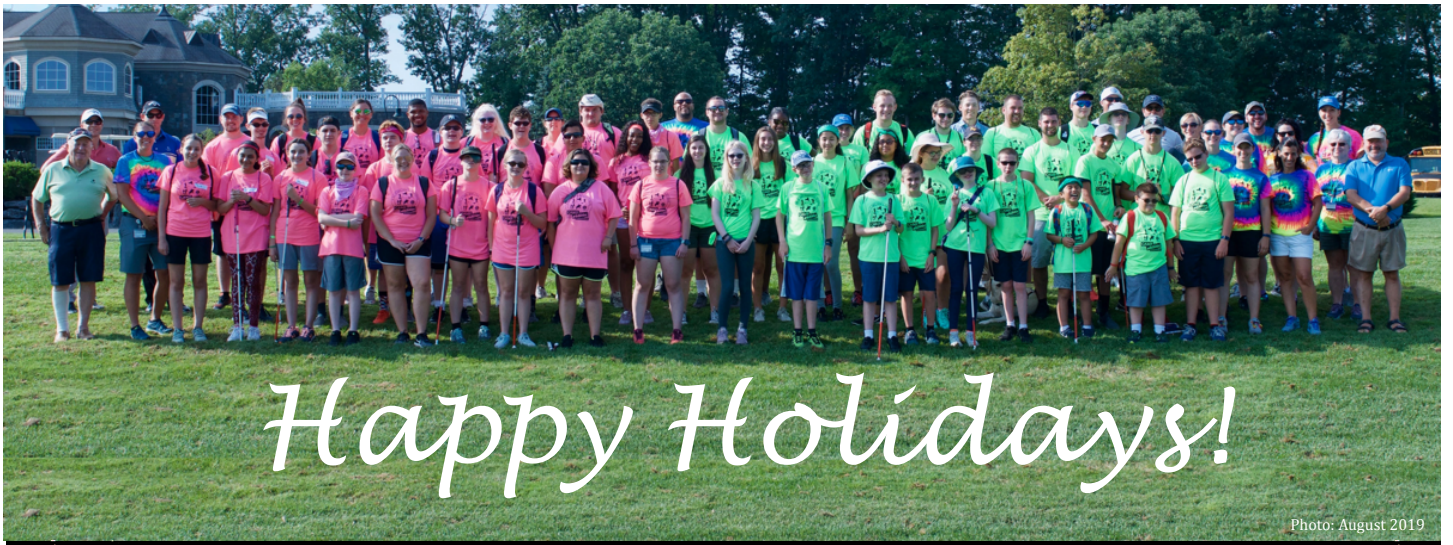
Photo: August 2019

Thank You to Our Sponsors & Donors For Your Continued Support !!